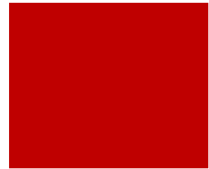
Brite Red 434R2256XT

SR .34 TE .87 SRI 36 SR .31 TE .88 SRI 32