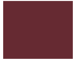
Colonial Red 434R2247XT

SR .32 TE .88 SRI 34 SR .26 TE .88 SRI 26