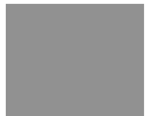
Silver Classic II 439RZ6948MXT

SR .29 TE .87 SRI 29 SR .26 TE .87 SRI 25